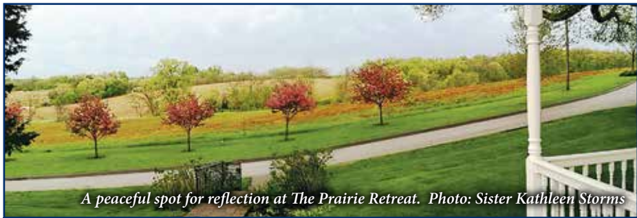
A peaceful spot for reflection at The Prairie Retreat.