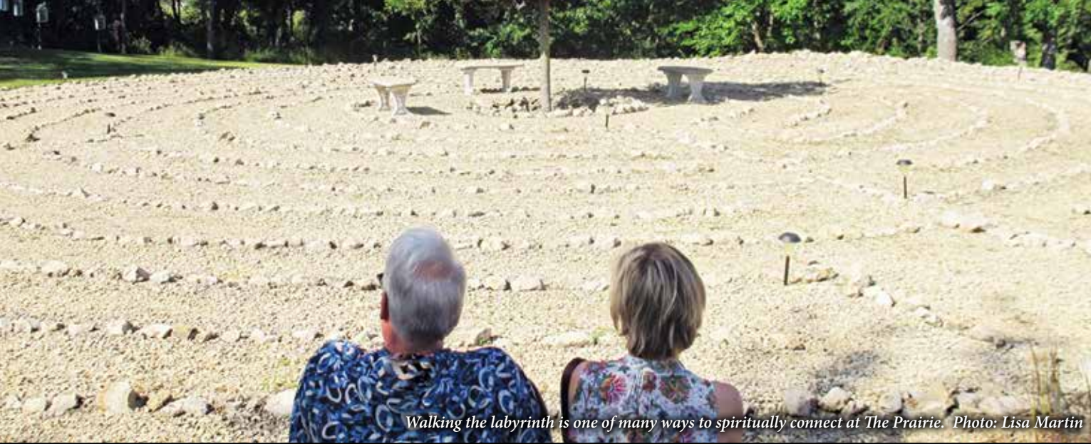
Walking the labyrinth is one of many ways to spiritually connect at The Prairie.