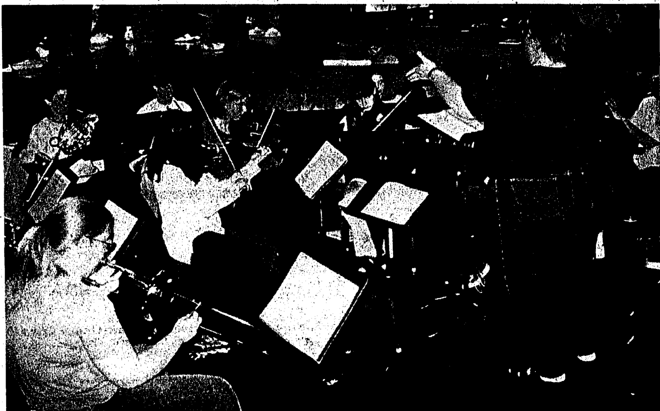
In the pit

Those attending Girls State are chosen on the basis of interest, leadership and scholastic qualities. The event is sponsored by American Legion Auxiliary.