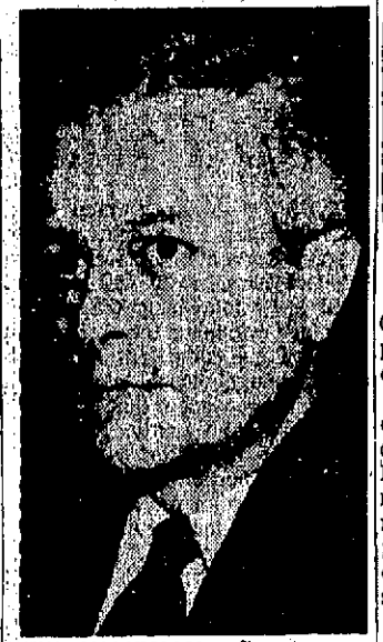
NEW CHAIRMAN —Congressman W. Sterling Cole (R-NY) will become chairman of the joint congressional atomic energy committee, according to Acting Chairman Carl T. Durham (D-NC). Durham replaced the late Sen. Brien McMahon of Connecticut.

The United States has about 29 per cent of the world's railroad mileage in about 6 per cent of the earth's land surface.