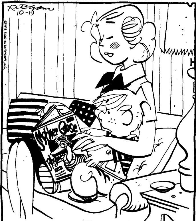
"I DON'T THINK IT WAS THE SPIDER THAT SCARED LITTLE MISS MUFFET... I'LL BET IT WAS THE CURDS AN' WHEY!"