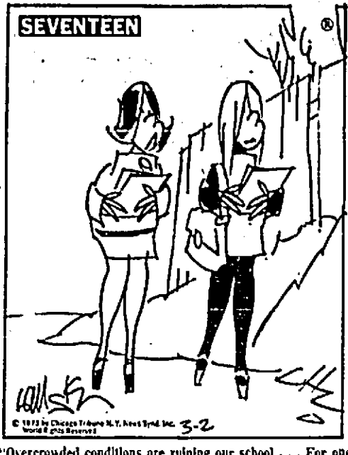
Overcrowded conditions are ruining our school... For one thing, there are too many girls!