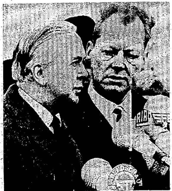
Wilson Welcomed at Berlin

LEAVENWORTH, Kan. (AP) — The barred doors of the federal penitentiary shut behind Billie Sol Estes Friday and he became just another number among the 2,250 inmates there. Estes spent two years fighting his conviction for mail fraud and conspiracy in a deal that involved about $24 million worth of mortgages on fertilizer tanks that did not exist. He was sentenced to 15 years.