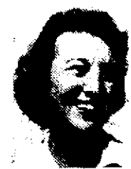
Ruth Elder ...in 1940