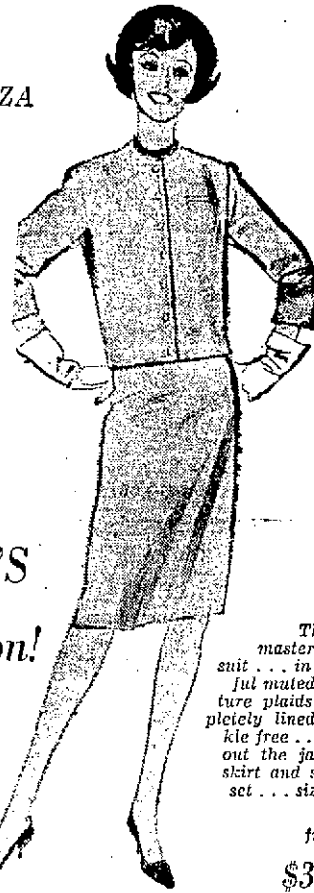
The Mae-master chanel suit... in beautiful muted miniature plaids... completely lined, wrinkle free... without the jacket, a skirt and sweater set... sizes 8 to 16... from $37.90