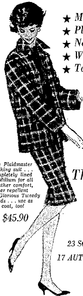
The Plaidmaster walking suit... completely lined in Millum for all weather comfort, water repellent in Glorious Tweed plaids... use as car coat, too!