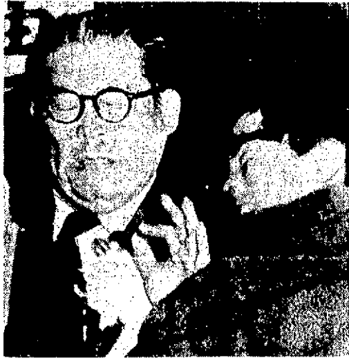
ASSASSINATION IN JAPAN —Inejiro Asanuma, left, chairman of Japan's Socialist party, winced as he was stabbed by 17-year-old Otaya Yamaguchi during a political rally in Tokyo. Asanuma was later stabbed a second time by the bespectacled youth and died en-route to the hospital.