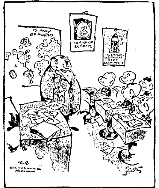
"Is important to know global geography, comrade kiddies! . . . If is not knowing where is trouble spots, how is knowing where to send trouble-makers? . . ."