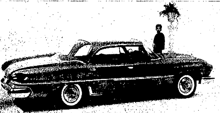
'1961 DODGE —The Polara is Dodge's entry in the low-medium price car market. The 122-inch wheelbase is available in 6 models with options of 3 engines ranging in horsepower from 265 to 330. Sloping fenders and a large concave grille are part of the new styling on the Dodge. Dealer for Dodge in Cedar Rapids is Handler Motor Co., 712 Second ave. SE.