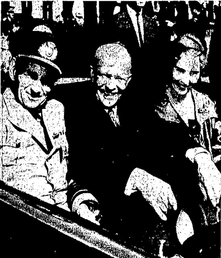
DANISH KING AND QUEEN ARRIVE —President Eisenhower sat between Danish King Frederik and Queen Ingrid in his car as they left National airport Tuesday after an arrival for a 3-day state visit in Washington.