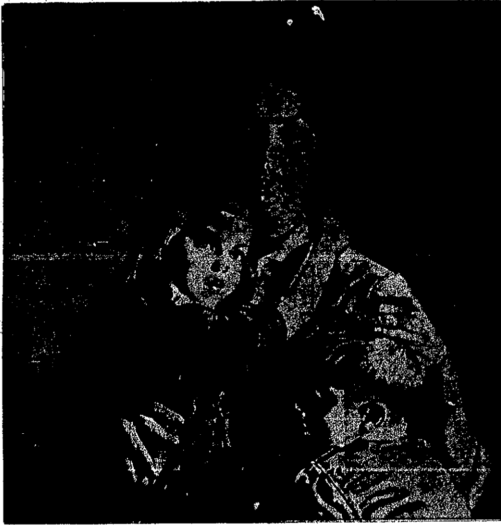
GENERAL SOLICITATION in the Cedar Rapids-Marion United Fund campaign will begin following tonight's kickoff banquet in the Roosevelt hotel. The campaign is designed to raise $555,796 to help operate 24 agencies during 1961 . . . Four other Eastern Iowa united campaigns already are under way. Those campaigns and goals are: Anamosa United Fund, $8,170; Buchanan County United Fund, $32,878; Oelwein Community Chest, $18,003; Winneshiek County United Fund, $29,000 . . . Scheduled to start later this month are the Fayette County United Fund, $27,834, and the Vinton Community Chest, $7,300. Scheduled to be completed by this time were the Benton-Canton-Shellsburg Community Chest, $1,905; Iowa City United Fund, $77,967; Maréngo Community Chest, $4,285. Nationwide, there are 795 united campaigns to raise a total of $435,842,379.